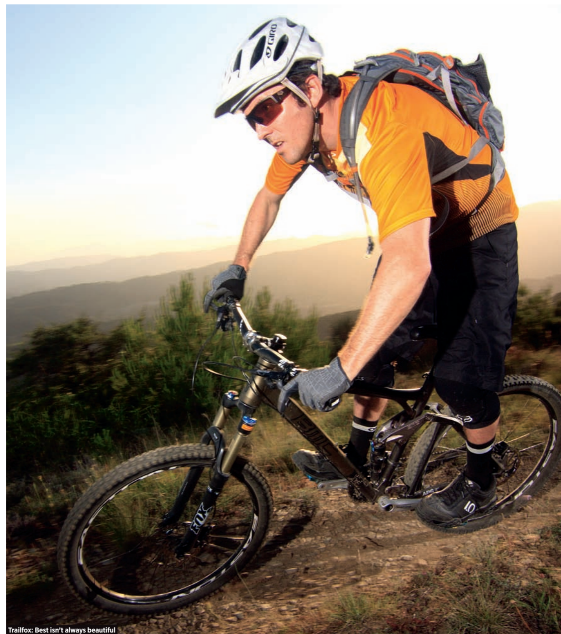
Trailfox: Best isn't always beautiful

Never judge a book by its cover; our praise for the Trailfox surprised everyone